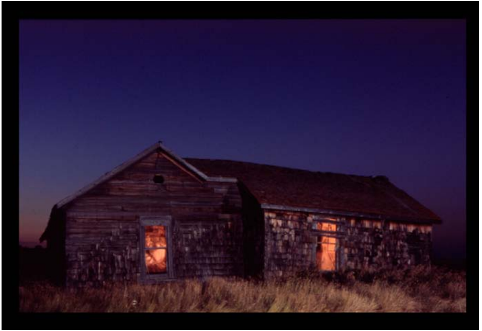
"echolocation" – installation in the farmhouse, 1999