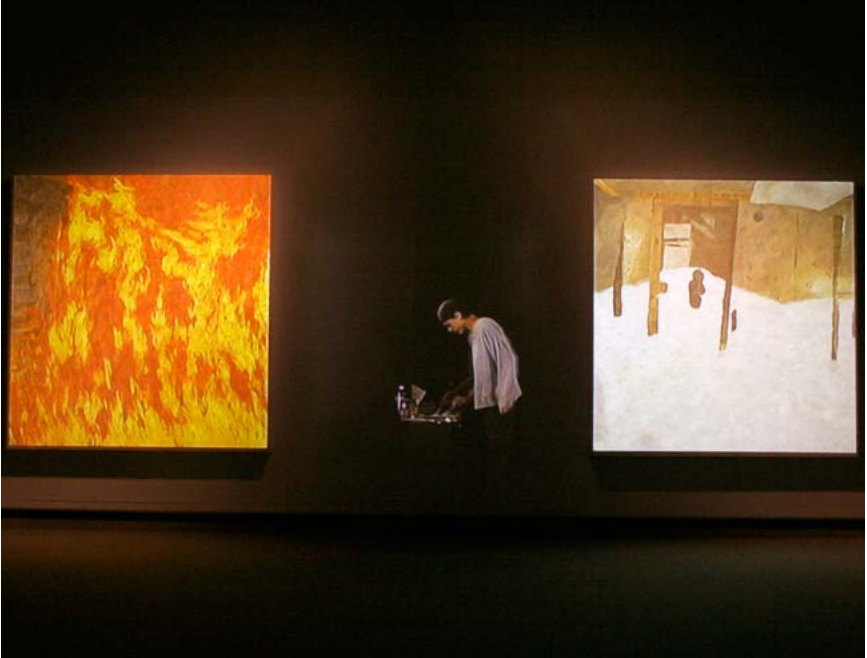
Abandon, by the old dirt road, oil on canvas, audio and projected video, 2006 Courtesy of the Saskatchewan Arts Board Permanent Collection

Opening Reception: Friday, January 6th 7–10 pm